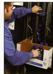
Quick loading products stack with convenient stowable case support rack