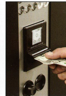
MDB compatible bill validator standard