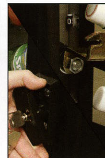
Quick turn locking system

Venco, Inc. Stanford Financial Center 2600 El Camino Real Palo Alto, CA 94306 www.venco.com Telephone: (650) 493-2258 E-mail: venco@inreach.com