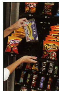
Tilt out trays for easy first-in-first-out loading