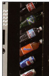
Lighted product display increases impulse sales