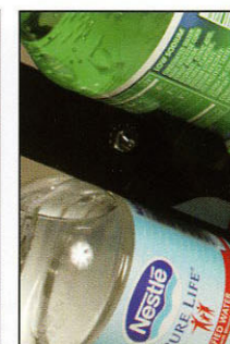
Simple snap in display product retainers